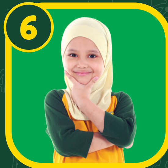
MENAAKUL Critical Thinking